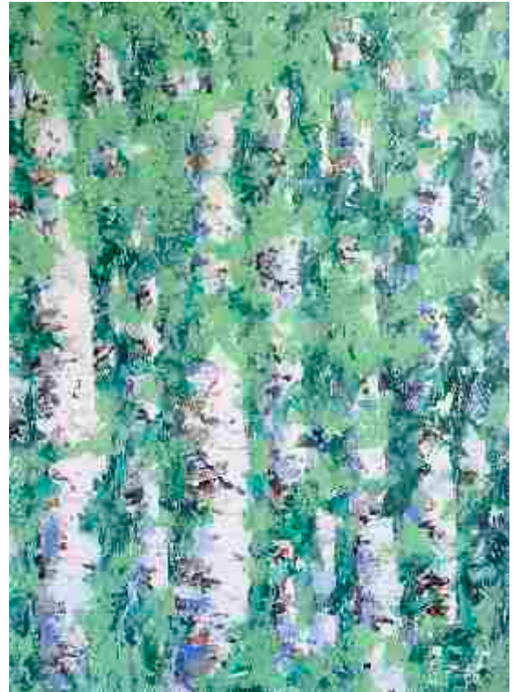
Breze 2 / Birches 2 akvarel, aquarelle, 100 x 70 cm, 2018.