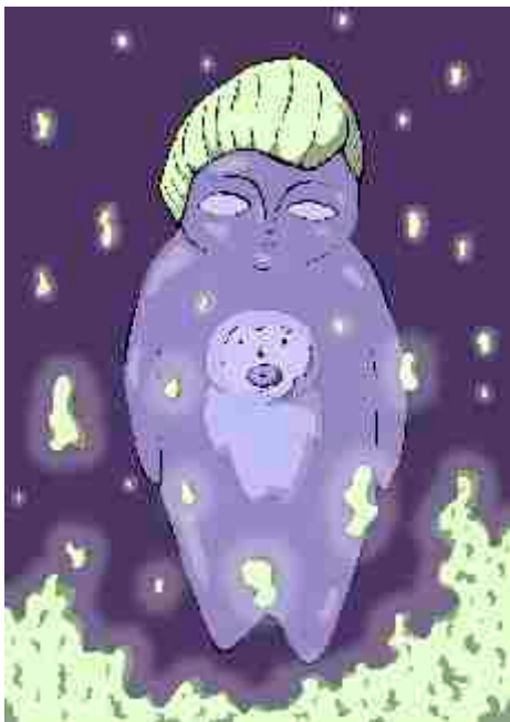
Lazar Tasić Majka 4 / Mother 4 digitalna štampa, digital print, 42 x 27.7 cm, 2019.