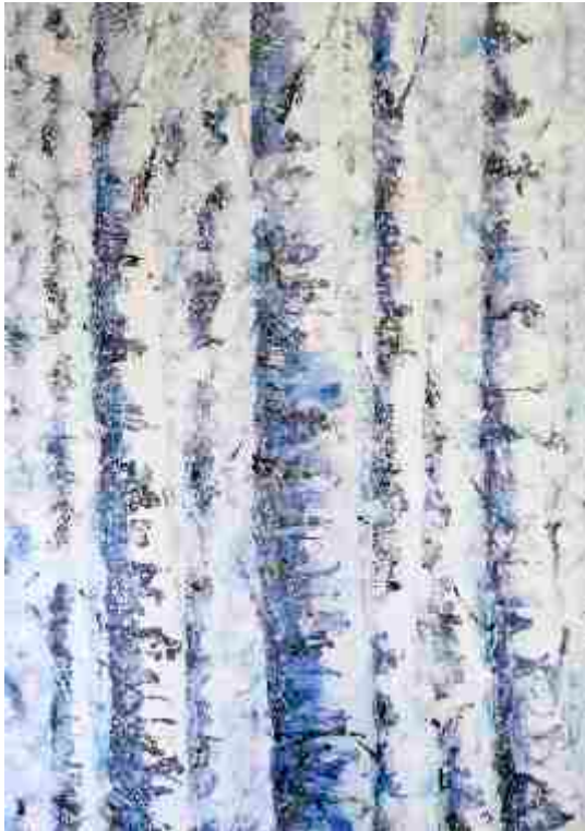
Breze 1 / Birches 1 akvarel, aquarelle, 100 x 70 cm, 2018.