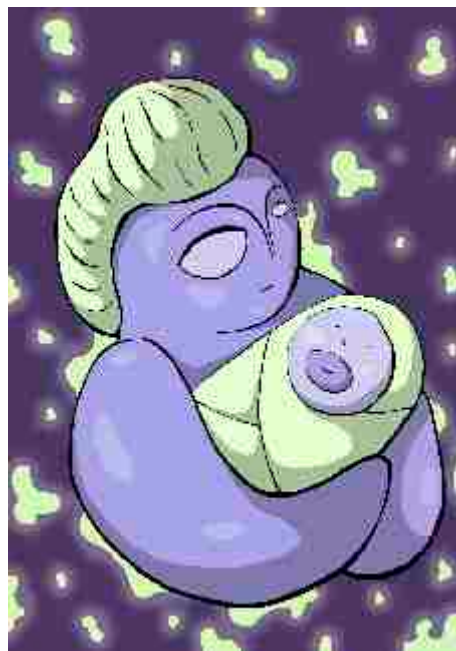
Lazar Tasić Majka 1 / Mother 1 digitalna štampa, digital print, 42 x 27.7 cm, 2019.