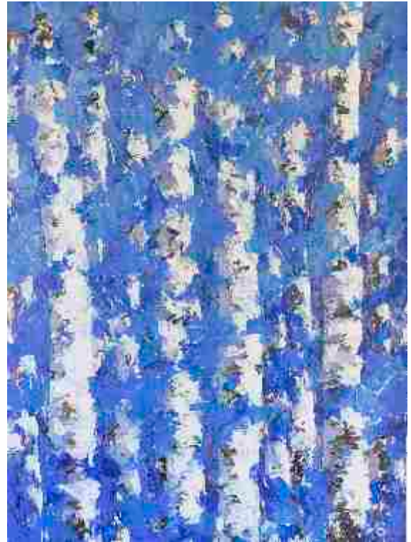
Breze 5 / Birches 5 akvarel, aquarelle, 100 x 70 cm, 2018.