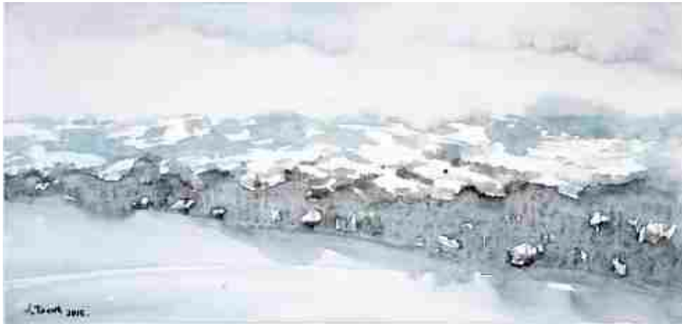
Zima 2 / Winter 2, akvarel, aquarelle, 22 x 43 cm, 2015.