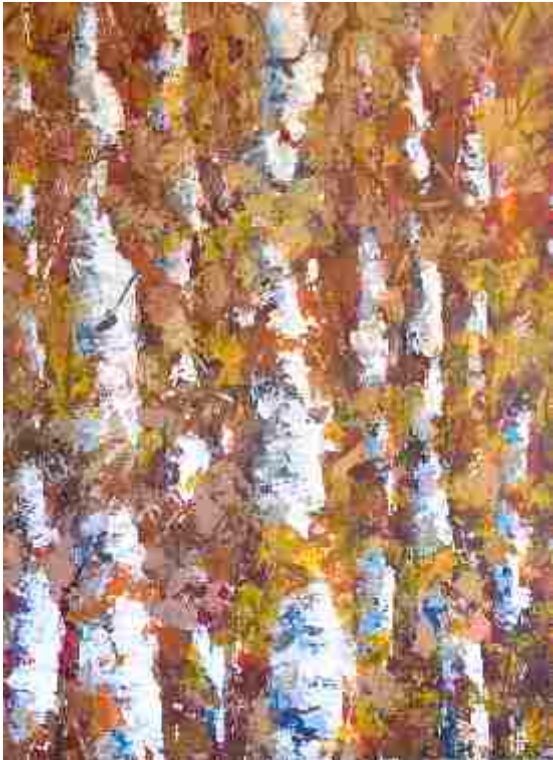
Breze 3 / Birches 3 akvarel, aquarelle, 100 x 70 cm, 2018.