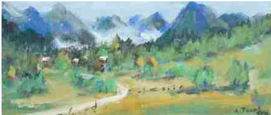
Motiv sa Durmitora / Motive from Durmitor akrilik, acrylic, 14 x 29 cm, 2016.